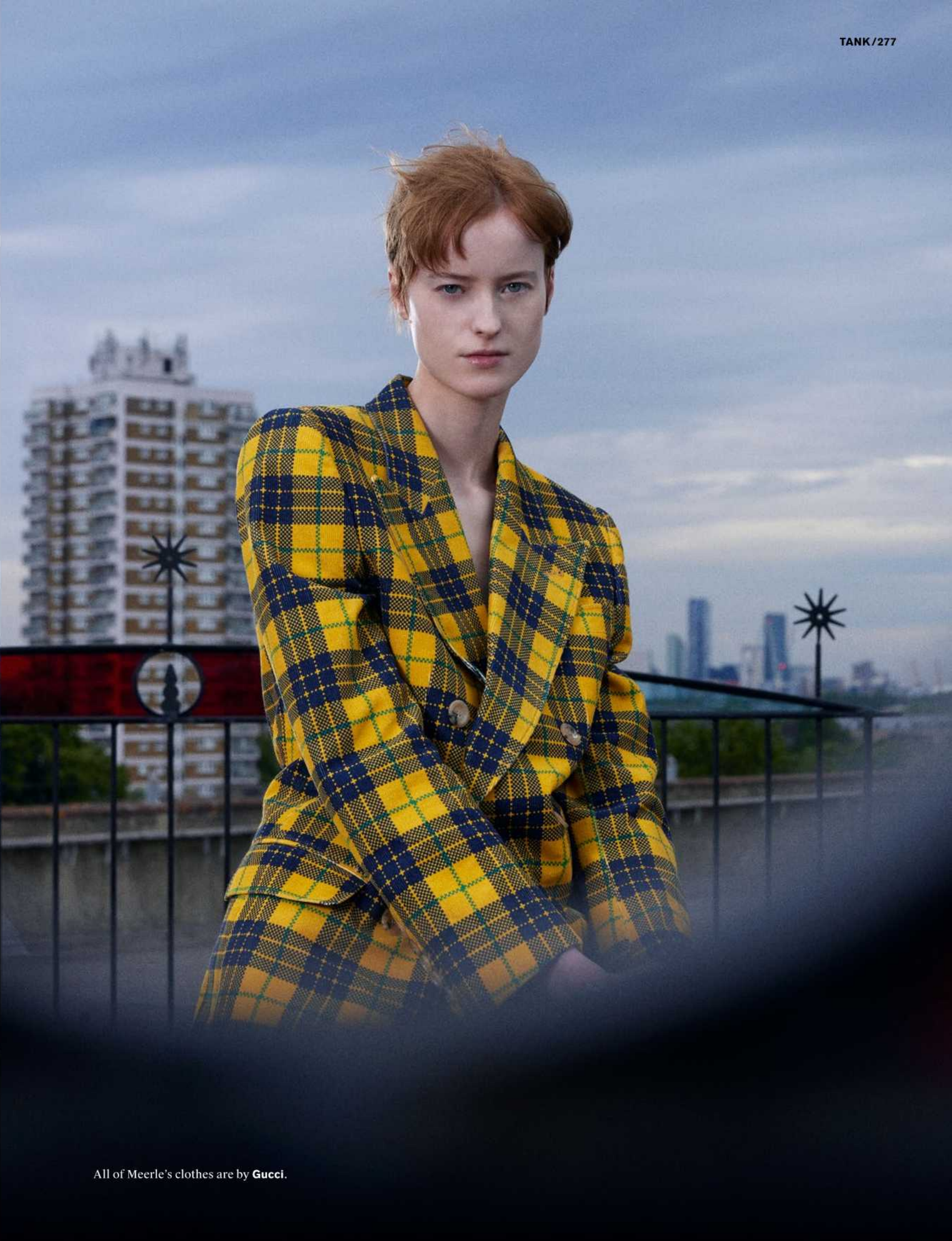
All of Meerle's clothes are by Gucci .