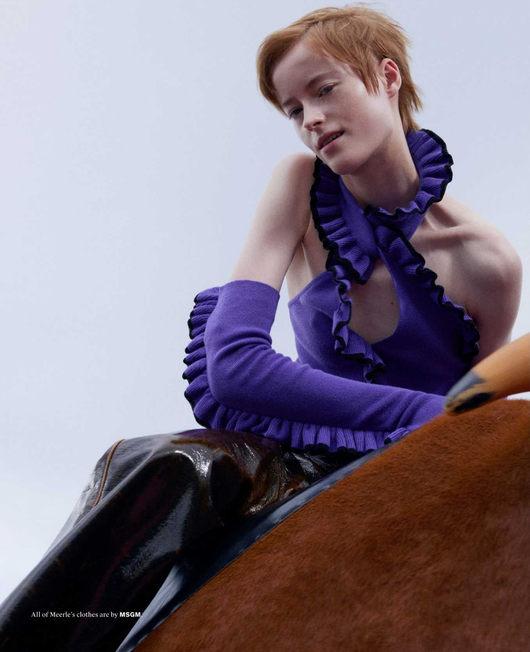
All of Meerle's clothes are by MSGM .