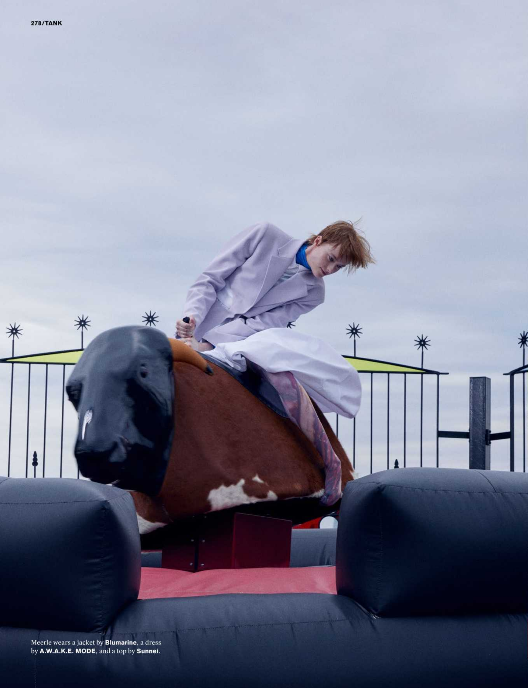
Meerle wears a jacket by Blumarine , a dress by A.W.A.K.E. MODE , and a top by Sunnei .